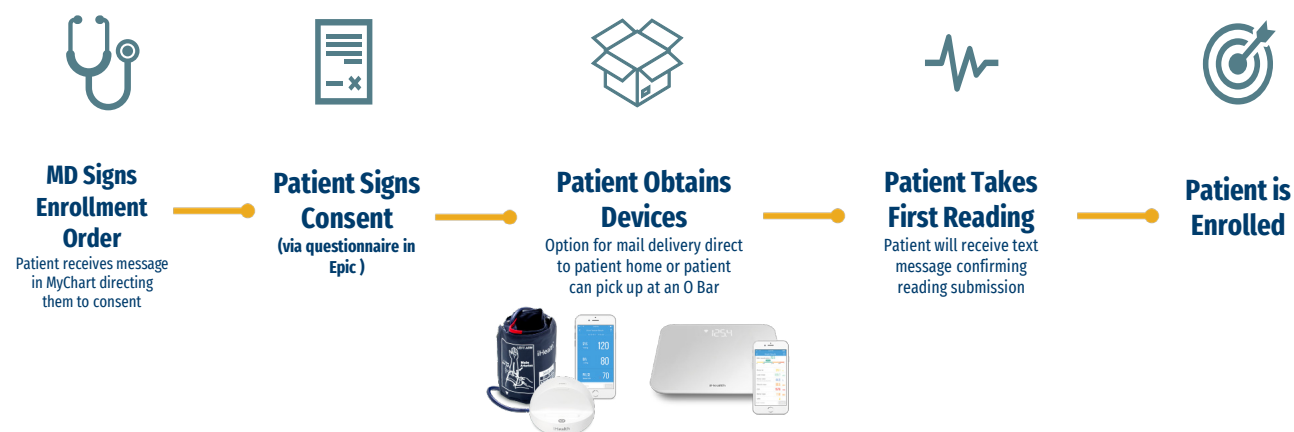
FIGURE 1: Overview of Connected MOM patient enrollment

Technical support is available to guide members through the process step-by-step.